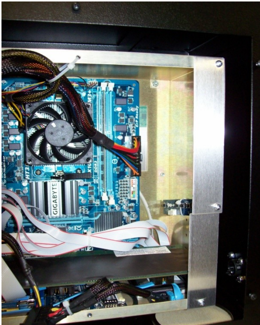
Figure 2 CPU10(B) Holder