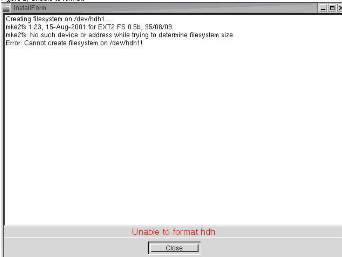
Figure 2, Unable to format.

9. If you see "unable to Format hda (hdb, hdc, etc...)" message, figure 2. Repeat step 5 to step 7 with a different flash card device drive letter, and.