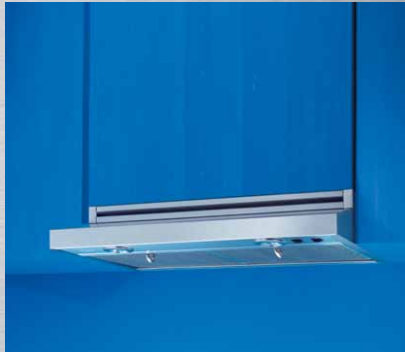
6" High Wall Hood with Standard Interior-Power Ventilator