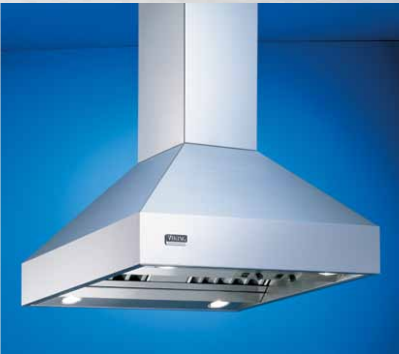
Professional Chimney Island Hood