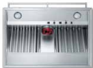
18" H. Professional Wall Hood

Heat lamps are a much-appreciated convenience when cooking large meals.