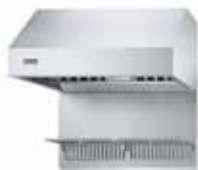
Wall Hood Warming Shelf Panels