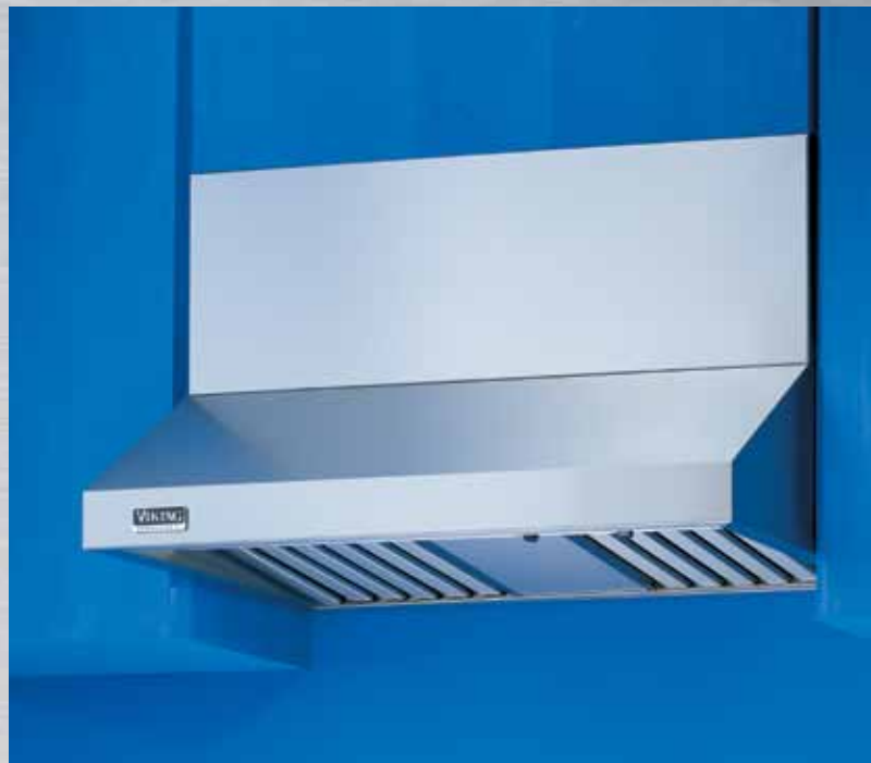
10' High Professional Wall Hood with Standard Interior-Power Ventilator