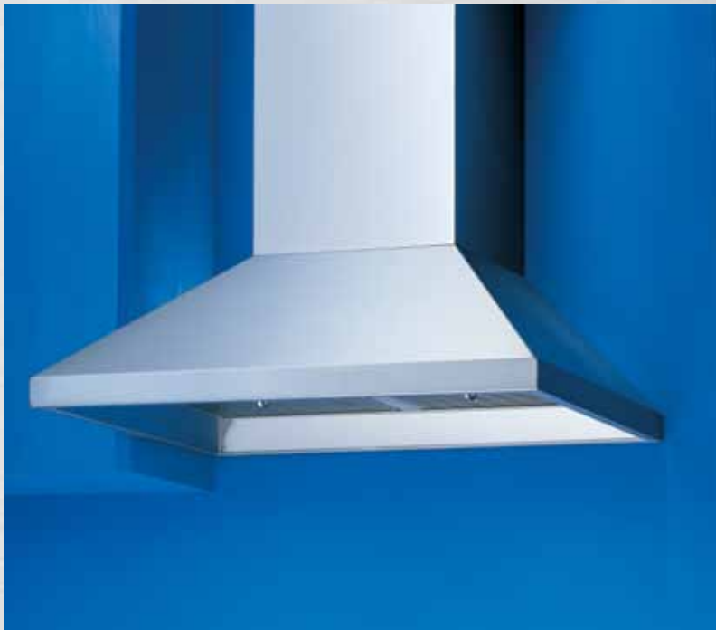
Classic Chimney Wall Hood with Standard Interior-Power Ventilator

30" width - DTWS30491 36" width - DTWS36491 42" width - DTWS42491 48" width - DTWS48491