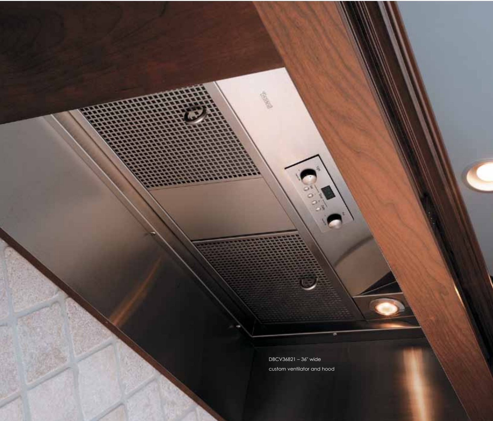
DBC36821 – 36" wide custom ventilator and hood