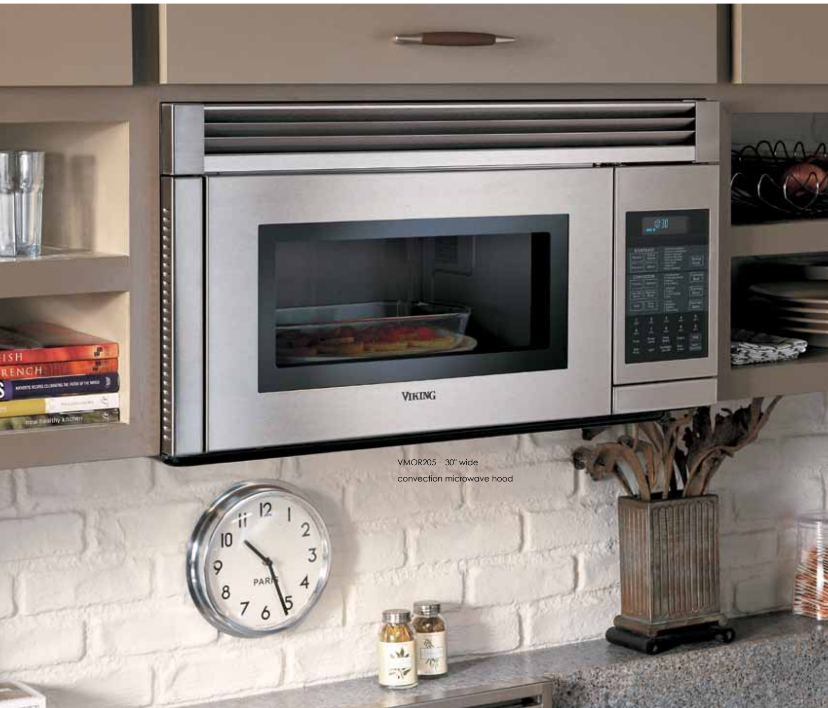
VMOR205 – 30" wide convection microwave hood