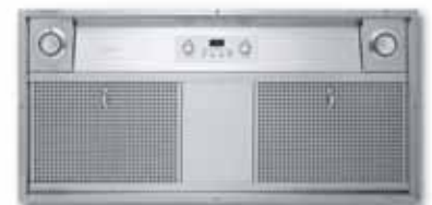
Wall Hood Custom Ventilator