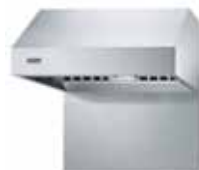
Wall Hood Backsplashes