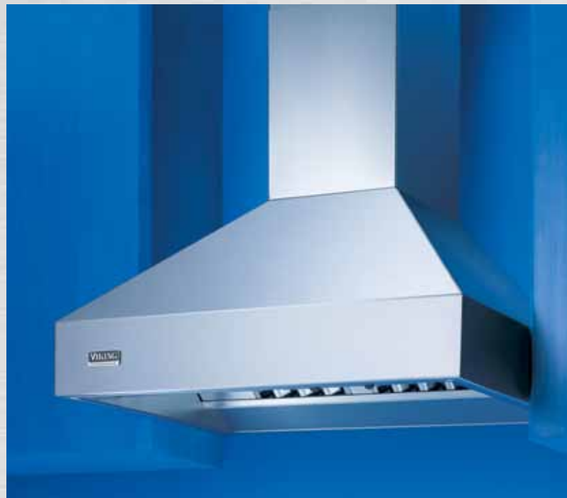
Professional Chimney Wall Hood

30" width - VCWH30481 36" width - VCWH36481 42" width - VCWH42481 48" width - VCWH48481 54" width - VCWH54481 60" width - VCWH60481 66" width - VCWH66481