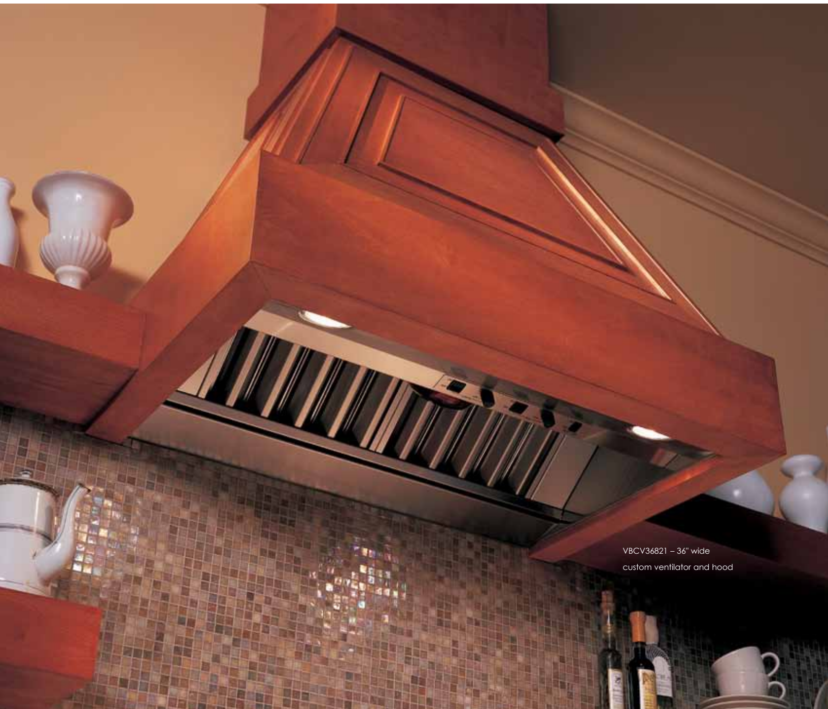
VBCV36821 – 36" wide custom ventilator and hood