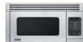
Convection Microwave Hood