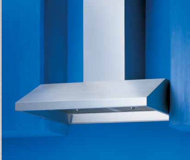
Slim Traditional Wall Hood

30" width - DTWS30491 36" width - DTWS36491 42" width - DTWS42491 48" width - DTWS48491