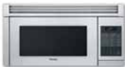
Convection Microwave Hood