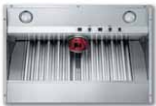
Wall Hood Custom Ventilator