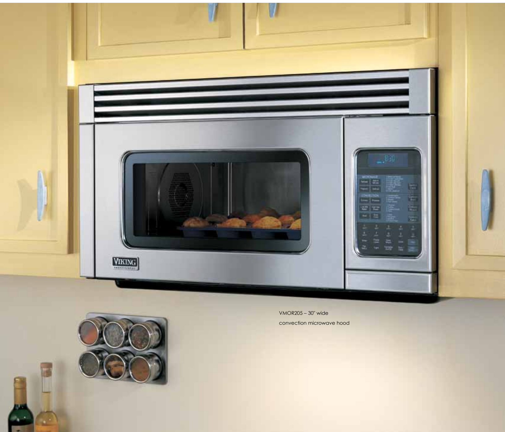
VMOR205 – 30" wide convection microwave hood

Four convection cooking modes and an exhaust system offer the performance to go from light and fluffy to seared and juicy.