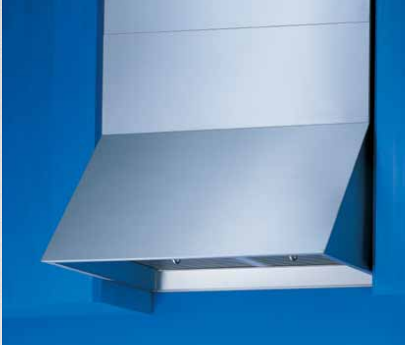
Tall Traditional Ledgeless Wall Hood

30" width - DTWN30481 36" width - DTWN36481 42" width - DTWN42481 48" width - DTWN48481