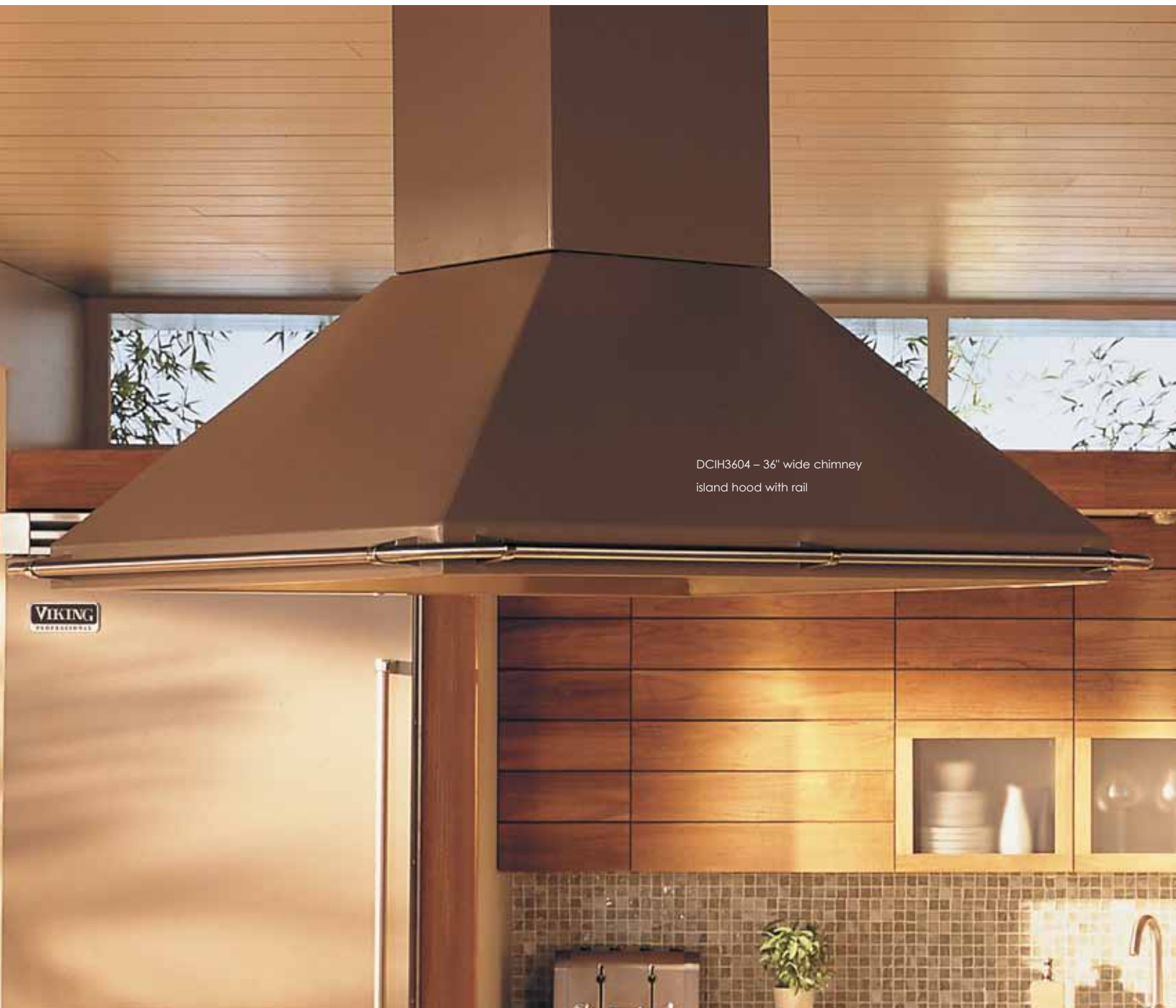
DCIH3604 – 36" wide chimney island hood with rail