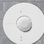
Radio Powr Savr™ wireless occupancy/vacancy sensor